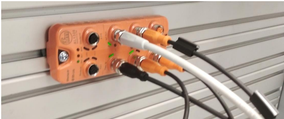
An IO-Link master device mounted onto the JMETS.

For more information about the JMETS, its setup, and its accessory components, visit https://www.intelitekdownloads.com/Manuals/IndustrialMaint/ and download the relevant user guides.